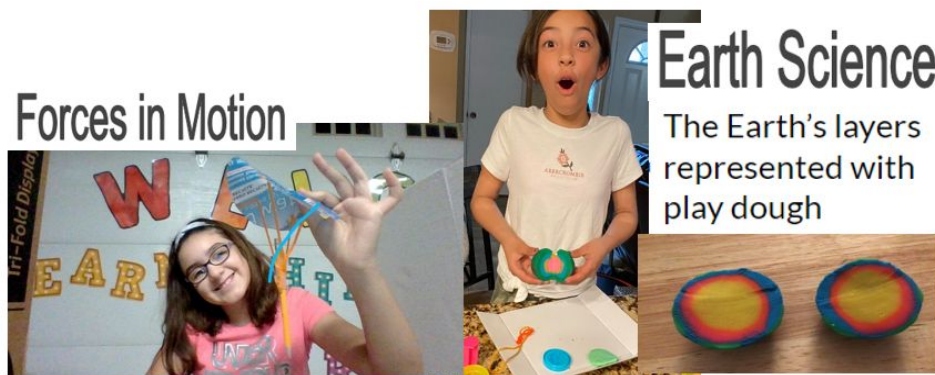
Students photographed above are engaged in the online, at home after school STEM Club at OVH and Sunset.